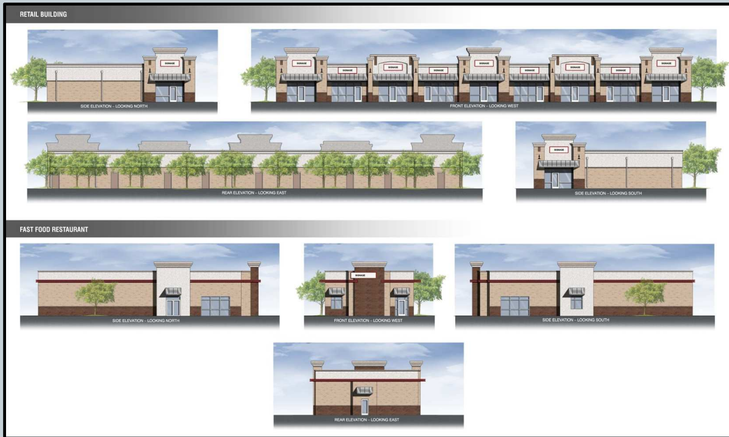
Proposed elevations – retail building and restaurant