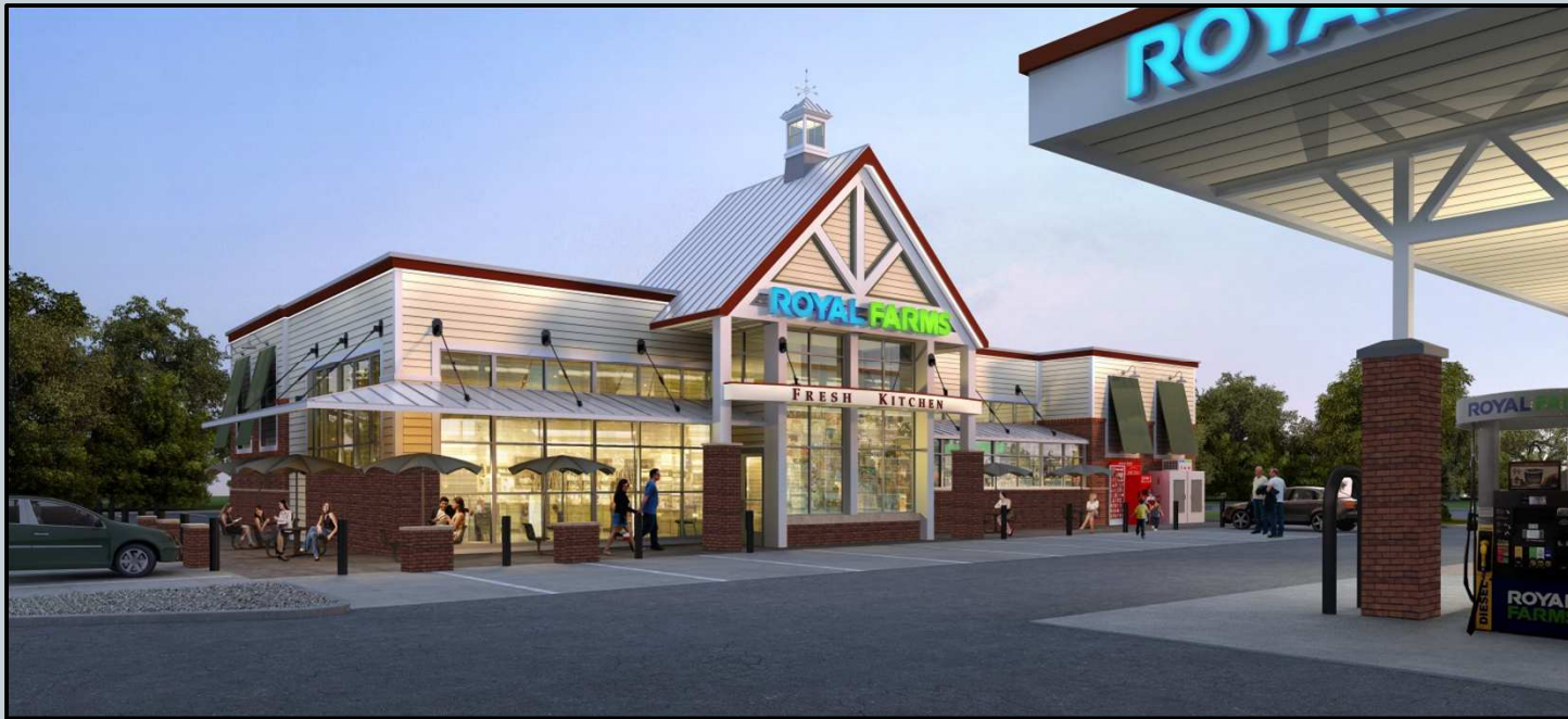
Proposed elevations – convenience store